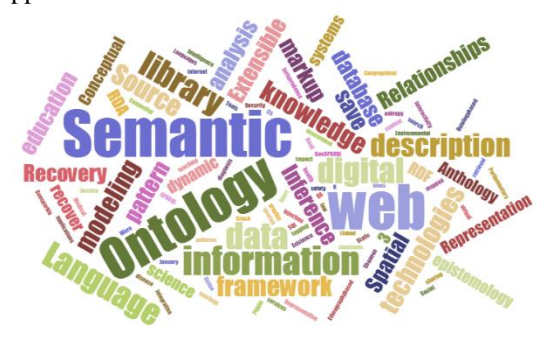
Fig 1. the Word Cloud semantic web application

Ontology and the source description framework are in second and third place with 17 and 4 repetitions, respectively. The following are Word Cloud topics in the field of semantic web applications.