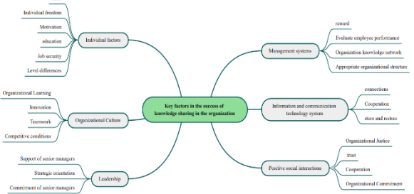
Figure 4. Summary of key success factors for knowledge sharing in the organization

Mental norm is a function of one's beliefs and plays a significant role in influencing one's motivation to engage in knowledge-sharing activities. The findings of researchers Bilgihan et al and 2016 show that mental norms are to put pressure on an individual to complete a particular behavior. Perceived mental norms in the environment, directly or indirectly, have a great impact on the individual.