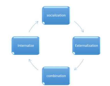
Figure 2. Transformation of organizational knowledge

According to Nonako & Takichi (1995), there are four modes of knowledge exchange: socializing (hidden to hidden), externalizing (hidden to explicit), combining (implicit to explicit), and internalizing (explicit to implicit).